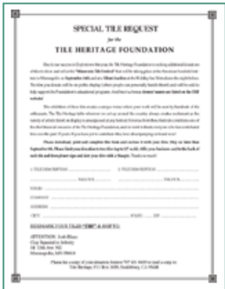
Click here for Printable Version.

Registration forms for the conference are now available.