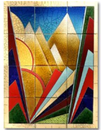
"Pandora's Box" by Richard Gruchalla and Carrin Rosetti. Courtesy Sivertson Gallery.

“ Tiles of the Northern Plains: Building on Tradition, ” the 11th conference of its kind presented by the Tile Heritage Foundation, each one in a different part of the country, offers participants an in-depth look at America’s ceramic heritage through lectures, tours, exhibitions and workshops. By focusing on the achievements of both early and contemporary tile makers and exploring the context that has spawned this creativity, the conference serves to enhance the appreciation of ceramic tile as a significant decorative art form and an important part of America’s cultural heritage. More information and a registration form can be found at www.tileheritage.org .