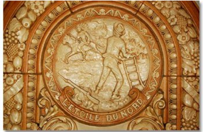
Fountain, Hotel Duluth (now Greysolon Plaza), 1925.