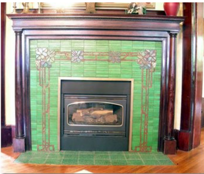
In the style of Tiffany Studios.